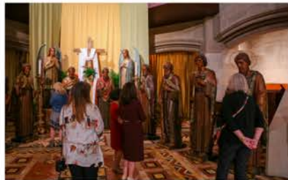
Cathedral of the Most Blessed Sacrament

9844 Woodward Avenue Detroit, Michigan 48202